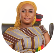
H.E. Hajia Samira Bawumia